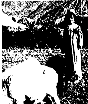
Hunza children are all obedient, well-mannered and respectful to their parents. There is no juvenile delinquency in Hunza. In fact, there are no police or jails. There hasn't been a crime reported in Hunza for 130 years!

which eliminates a wrinkle causing skin deposit. This oil is also a natural skin preserver.