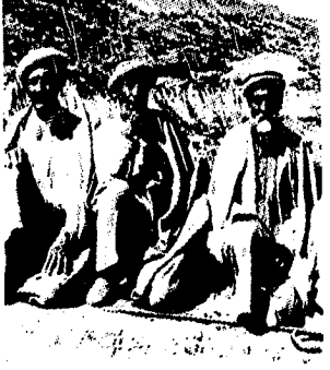
These Hunza elders are men of nearly 100 years old. They have perfect health, teeth, eyesight, mental abilities, full heads of hair and many father children at this age. They can walk a 65 mile mountain trail with full pack and immediately start working in the fields again!

This all sounds too good to believe, but, the following eye opening experi-