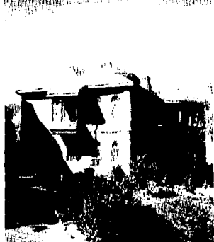
The simple but warm and friendly home of the Mir (ruler) of Hunza. The Mir has been getting many more interested visitors recently which include such celebrities as Chou En Lai of China and Queen Elizabeth of England.