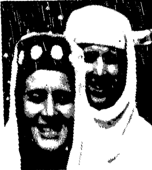
These Hunza women are over 50 years old. Hunza women have perfect health, figures and complexions. Hunza women of 80 look like American women of 40. Their complexion secret lies in an oil from a certain fruit. With this oil they are able to avoid wrinkles almost indefinitely. The oil is said to remove a deposit which the pores emit only on the facial area and it is this deposit which is responsible for wrinkles. The oil is also a natural skin preserver.